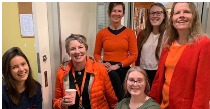
TLA's Civil Team turning orange for Mental Health Week 2021.